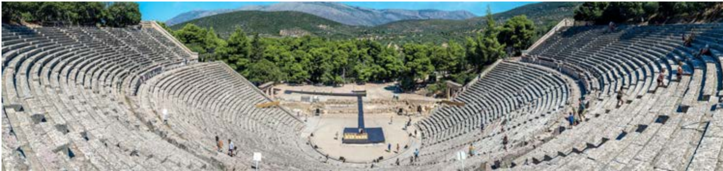
Ancient Epidavros, near Tolon and Nafplion