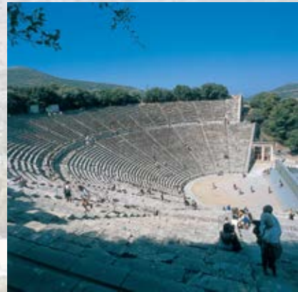
Ancient Epidavros Theatre