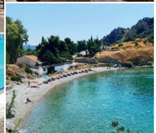
Ancient Assini bay is just over the headland