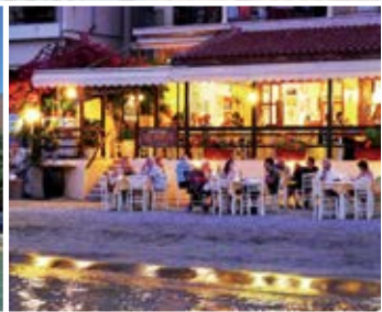
Romvi al fresco dining